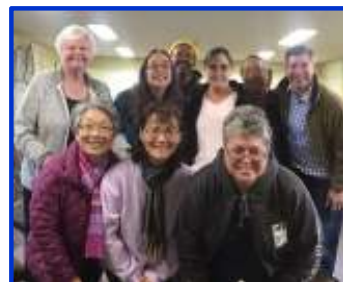
Westview's leadership team at the retreat

"Do not fear, for I have redeemed you; I have summoned you by name; you are mine. See, I am doing a new thing! Now it springs up; do you not perceive it? I am making a way in the wilderness and streams in the wasteland. - Isaiah 43: 1b, 19