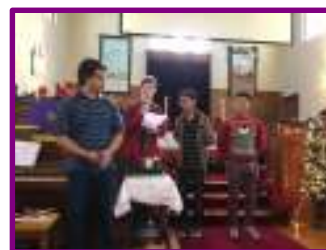
Photo at right is our youth and youth adults leading the advent candle lighting during worship service.