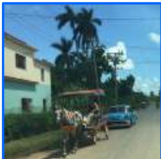
Photo above: Cuba