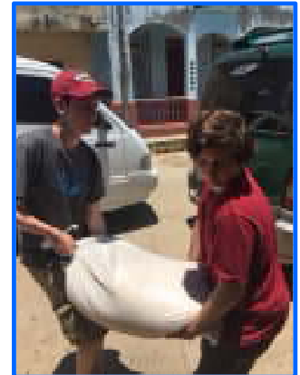
Photos above (starting from left): The Youth Mission Team visiting a Cuba Special Needs Kids Club. Photo on the right are members of the Youth Mission Team distributing food in Cuba.