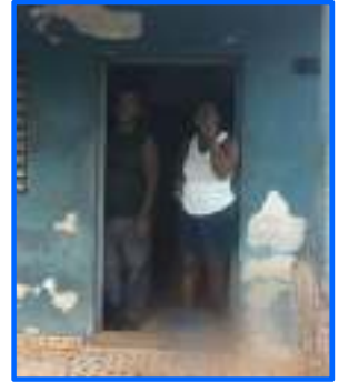
Photos above (starting from left): First two photos are two special needs people that the Youth Mission Team visited and later delivered food to in Cuba. Photo on right is a mom shedding a tear after the Youth Mission Team visited her special needs son.